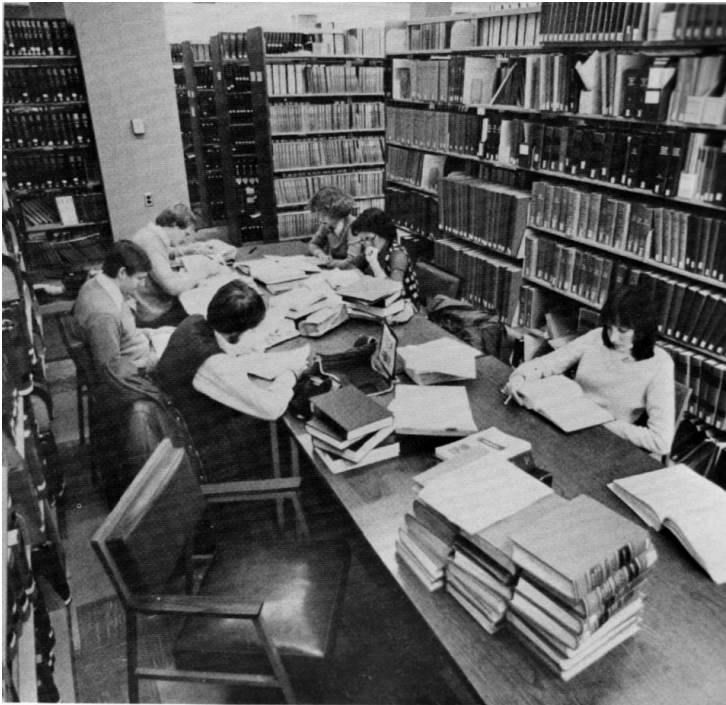
Crowded stacks in the Law Center Law Library in 1979.

a Law Library bursting its seams with books but with no space for them to carry out their educational assignments. 2187