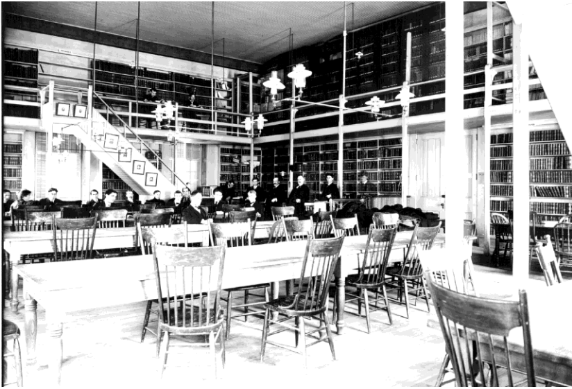
Reading Room, Old Capitol Law Library 1905.

Although class sizes continued to grow, the only relief for the Law Library came at the expense of other elements of the Law Department. Recognizing that the small room that housed the law library could barely hold a quarter of the class in 1875, 4 the faculty shifted part of the collection into the law lecture room, creating a reading room for students when classes were not in session.