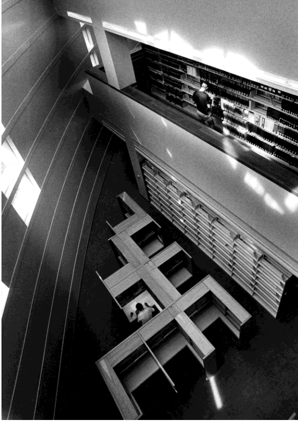
Overhead view of student carrels in Boyd Law Building.

and to the Technical Services Department 331 were reorganized twice between 1992 and 1999. Collection growth, however, necessitated more extensive changes to the facilities. After only 10 years in the Boyd Law Building, the microform cabinets that were purchased as part of the original equipment for the Audiovisual Room were filled to capacity with 1,092,876 microforms, the equivalent of 242,557 bound volumes. 332 To accommodate more microform cabinets, the adjacent room, previously used as a Government Documents office, was combined with the Audiovisual Room in order to enlarge the latter's capacity and functionality. 333