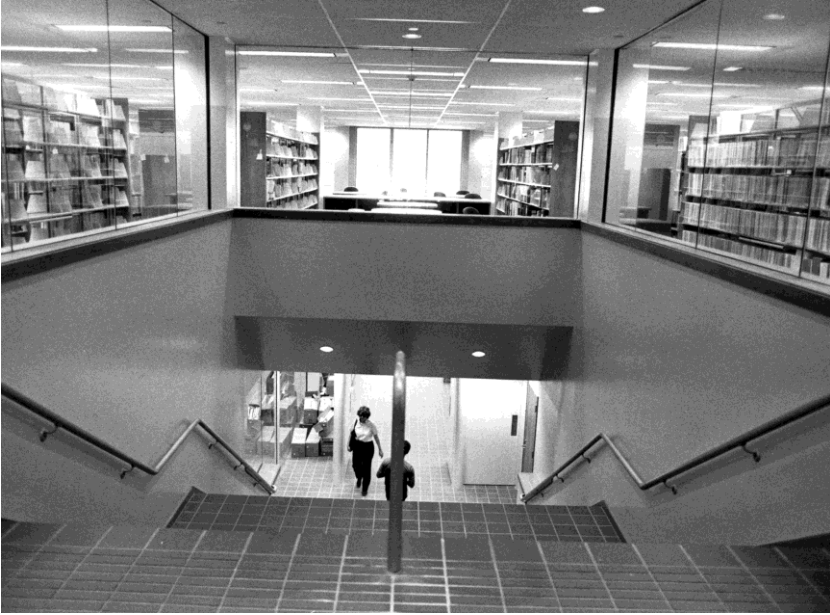
Lower entrance to Law Library from Grand Avenue.