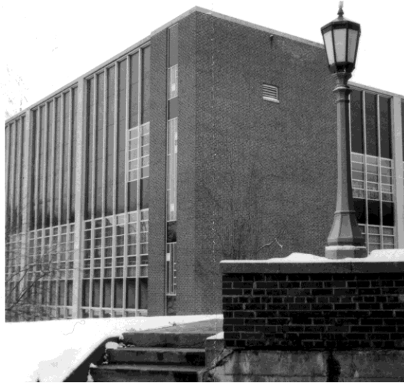
Exterior view of Law Library wing of the Law Center.

from 1960 to 1966, when she was succeeded by Richard Hutchins, who served until 1975. By fall 1962, the move was complete; the shelving units installed, the collection arranged on the new shelves, and “the tables and chairs from the old library . . . repaired and refinished for use on the lower levels of the new library.” 162 According to the Dean, the Law Library, in addition to adequate expansion space for the collection, had “table work space adequate for all students and for reasonable enrollment expansion.” 163